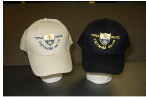
Six Panel Hat , $18.00 Available in khaki and black