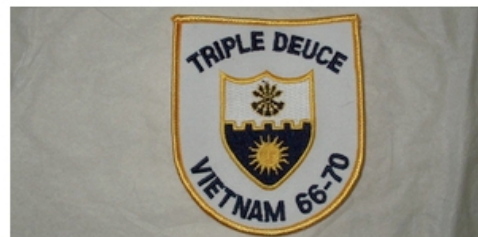
VN 2/22nd Patch $5.00 ea + $3.00 shipping