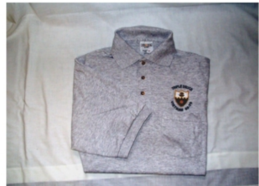
Grey Polo shirt with pocket. $28.00 ea. sizes small to XL $30.00 ea. sizes 2XL and 3XL Special colors add $3.00