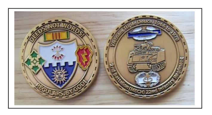
Actual size of the above coin is 1½ inch in diameter