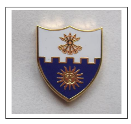
22<sup>nd</sup> Infantry Crest Pin. $7.00 ea + $3.00 for shipping