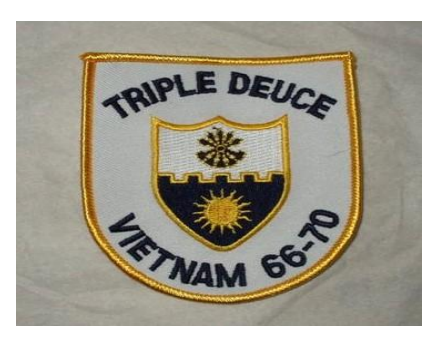
VN 222 Patch. $5.00 ea + $2.00 for shipping