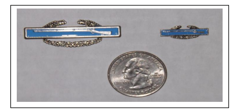
MIDI CIB $7.00 MINI CIB $5.00 Shipping $3.00