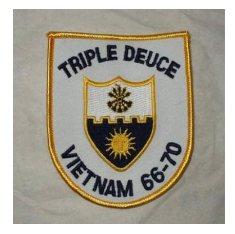
VN 222 Patch. $5.00 ea + $2.00 for shipping