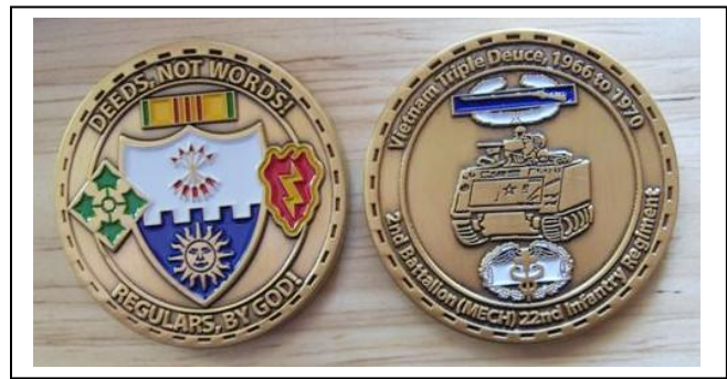
Actual size of the above coin is 1½ inch in diameter