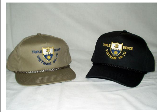
Hats: One Size fits all Colors: Black with Regiment Crest and Gold Letters Khaki with Regiment Crest and Blue Letters Hunter Orange with Regiment Crest All Hats are $15.00 ea + Shipping