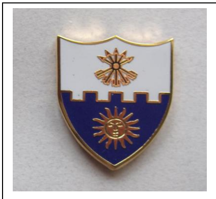
22 nd Infantry Crest Pin. $7.00 ea + $3.00 for shipping