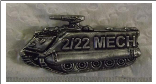
MECH Pin is $5.00 Shipping is $3.00