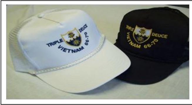
Summer hats, mesh back. White or Black