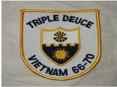
VN 222 Patch. $5.00 ea + $2.00 for shipping