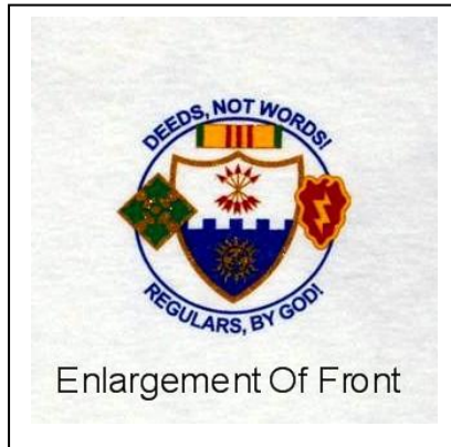
Enlargement Of Front