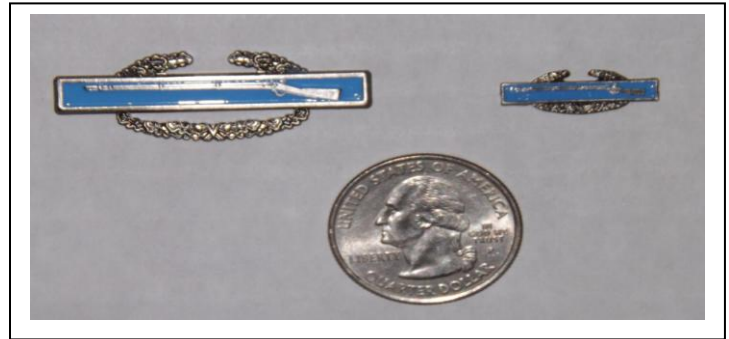
MIDI CIB $7.00 MINI CIB $5.00 Shipping $3.00