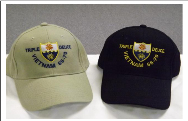
6 Panel Hats Black and Khaki