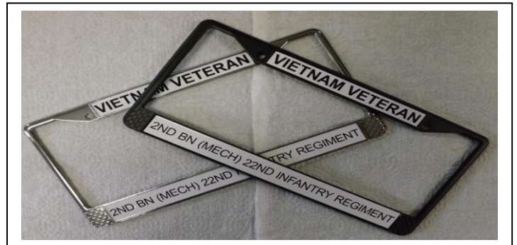
Triple Deuce License Plate Frames are now available in chrome or black. $12.00 each Shipping $8.00 up to two frames

Include your name, address, phone number and email address. If I'm out of something I'll let you know when to expect it. If you'd like something special, let me know. The guy who does the embroidery is an Air Force Vet and has great respect for you Infantrymen. If there is a way to put the logo on something he'll do it. Call me at 207-634-3355 or email to