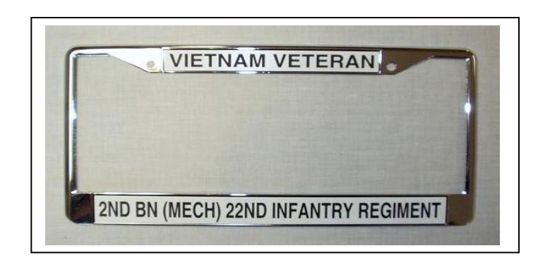
Triple Deuce Plate Frames $12.00 each Shipping $8.00 up to two frames

Include your name, address, phone number and email address. If I'm out of something I'll let you know when to expect it. If you'd like something special, let me know. The guy who does the embroidery is an Air Force Vet and has great respect for you Infantrymen. If there is a way to put the logo on something he'll do it. Call me at 207-634-3355 or email to <a href="mailto:ilmay@tds.net">ilmay@tds.net</a>