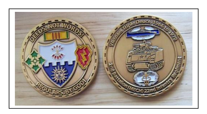
Actual size of the above coin is