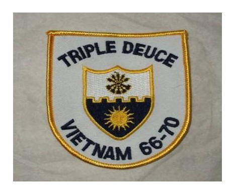
VN 222 Patch. $5.00 ea + $2.00 for shipping

1 Coin $10.00 ea. shipping included 5 Coins $ 9.00 ea. + $3.00 shipping 10 Coins $ 8.00 ea. + $4.00 shipping 15 Coins $ 7.00 ea. + $7.00 shipping 20 Coins $ 5.00 ea. + $7.00 shipping