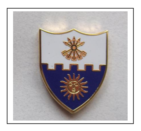
22<sup>nd</sup> Infantry Crest Pin. $7.00 ea + $2.00 for