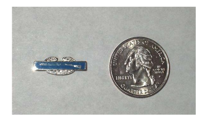
Mini CIB. $5.00 ea + $2.00 for shipping