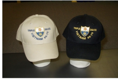
Six Panel Hat , $18.00 Available in khaki and black