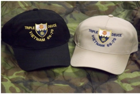
Five panel hat , $18.00 Available in khaki and black.