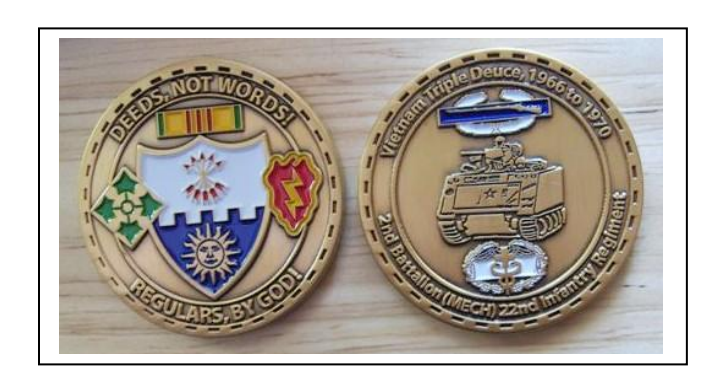
Actual size of the above coin is 1½ inch in diameter