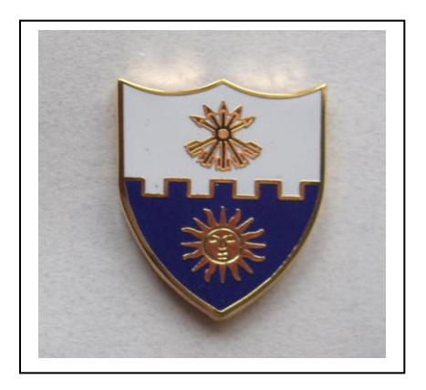
22<sup>nd</sup> Infantry Crest Pin. $7.00 ea + $3.00 for shipping