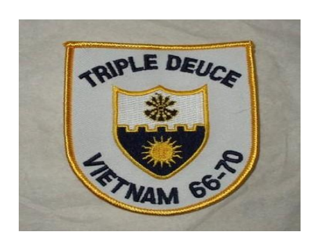
VN 222 Patch. $5.00 ea + $2.00 for shipping

1 Coin $10.00 ea. shipping included 5 Coins $ 9.00 ea. + $3.00 shipping 10 Coins $ 8.00 ea. + $4.00 shipping 15 Coins $ 7.00 ea. + $7.00 shipping 20 Coins $ 5.00 ea. + $7.00 shipping