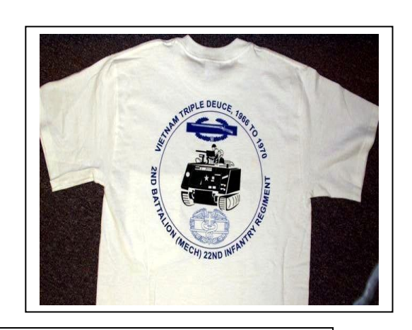
T-Shirts are $18.00 sizes Small thru XL. $20.00 for sizes XXL and larger Shipping is the same as the other shirts.