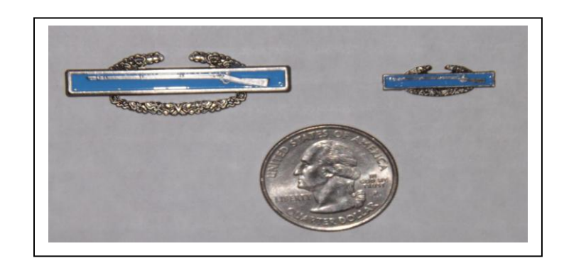
MIDI CIB $7.00 MINI CIB $5.00 Shipping $3.00