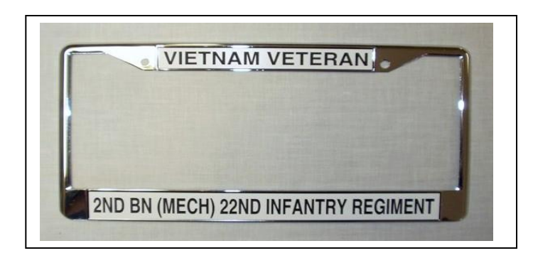
Triple Deuce Plate Frames $12.00 each Shipping $8.00 up to two frames

Include your name, address, phone number and email address. If I'm out of something I'll let you know when to expect it. If you'd like something special, let me know. The guy who does the embroidery is an Air Force Vet and has great respect for you Infantrymen. If there is a way to put the logo on something he'll do it. Call me at 207-634-3355 or email to <a href="mailto:ilmay@tds.net">ilmay@tds.net</a>