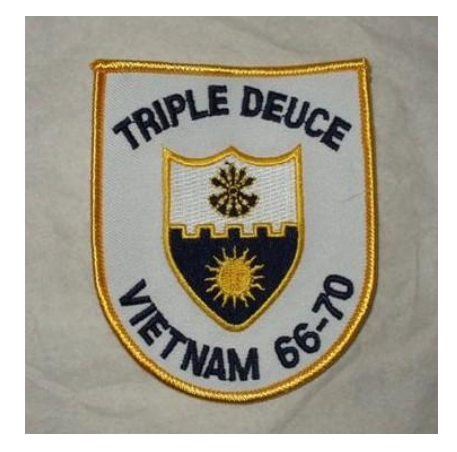
VN 222 Patch. $5.00 ea + $2.00 for shipping