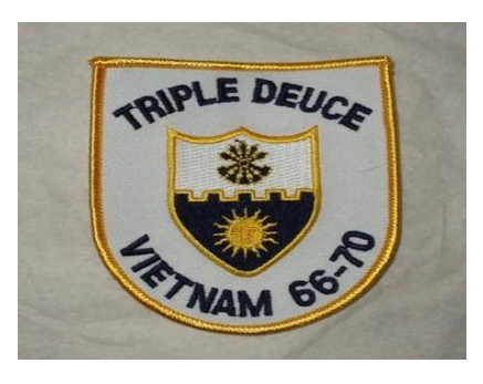
VN 222 Patch. $5.00 ea + $2.00 for shipping