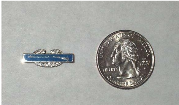
Mini CIB. $5.00 ea + $2.00 for shipping