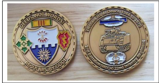
Actual size of the above coin is