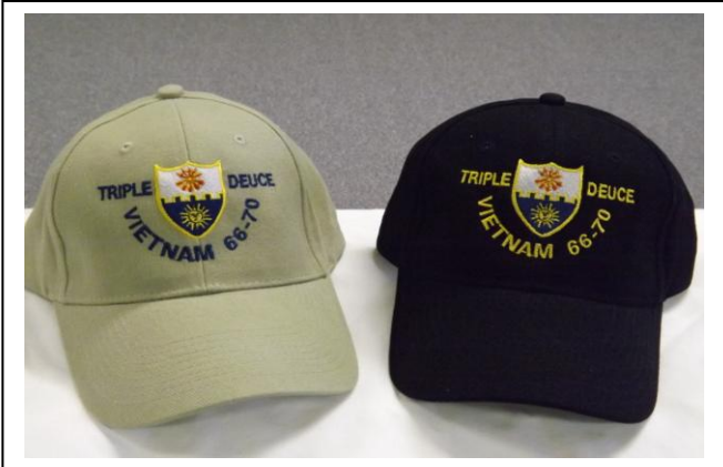
6 Panel Hats Black and Khaki