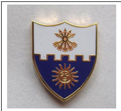
22 nd Infantry Crest Pin. $7.00 ea + $2.00 for shipping