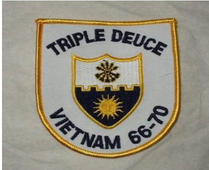
VN 222 Patch. $5.00 ea + $2.00 for shipping