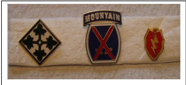
Pins are $5.00 ea + Shipping