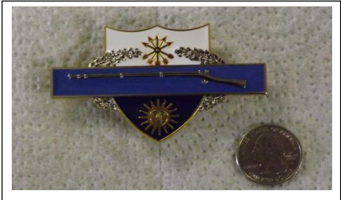
The CIB/DUI sells for $12.00 + $3.00 shipping. As with other pins there is no shipping charge if ordered with a shirt or hat.