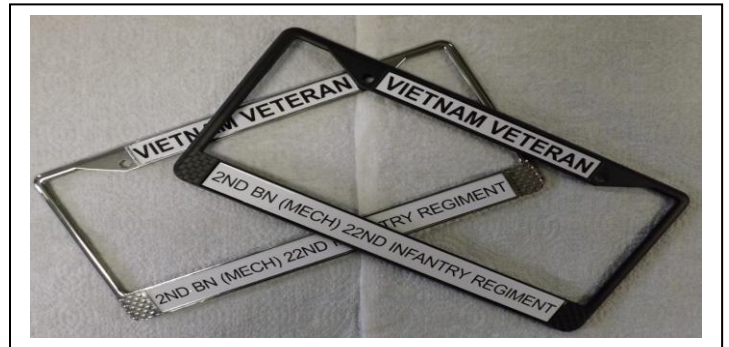
Triple Deuce License Plate Frames are now available in chrome or black. $12.00 each Shipping $8.00 up to two frames

Include your name, address, phone number and email address. If I'm out of something I'll let you know when to expect it. If you'd like something special, let me know. The guy who does the embroidery is an Air Force Vet and has great respect for you Infantrymen. If there is a way to put the logo on something he'll do it. Call me at 207-634-3355 or email to