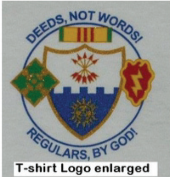
T-shirt Logo enlarged