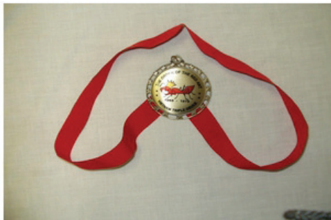
Lightweight ORA , 25% lighter than the Traditional Medal. $3.00 + $3.00 shipping. Frame your Traditional ORA Medal with your Certificate. You must have been awarded the ORA to be eligible to purchase this item