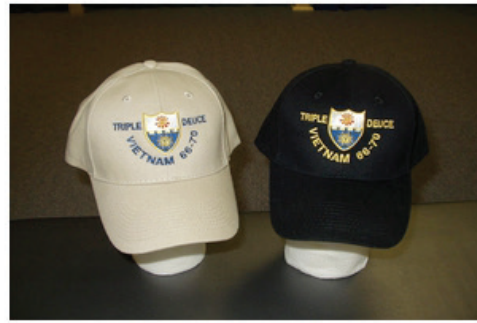
Six Panel Hat , $18.00 Available in khaki and black