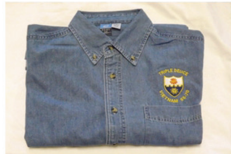
Dark denim long sleeve shirt with pocket. $35.00 sizes small to XL $37.00 sizes 2XL and 3XL Special colors add $5.00