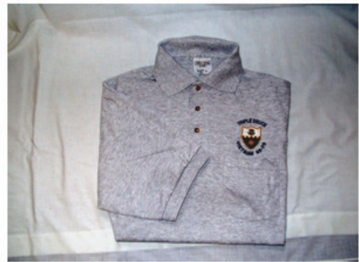
Grey Polo shirt with pocket. $28.00 ea. sizes small to XL $30.00 ea. sizes 2XL and 3XL Special colors add $3.00