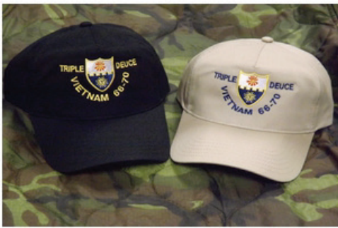
Five panel hat , $18.00 Available in khaki and black.