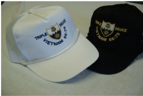
Summer Hat $18.00. Available in white and black. Five panel hat One size fits all